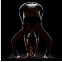
Can Exercise Keep You Young?