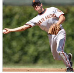
Vizquel's Path Could Stand as a Test for Jeter