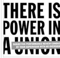
Op-Ed: Why Your Boss Is Wrong About You