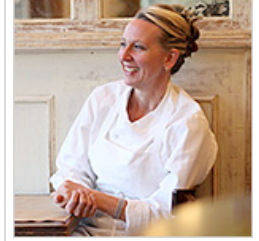
A Chef's Life, With Scars and All